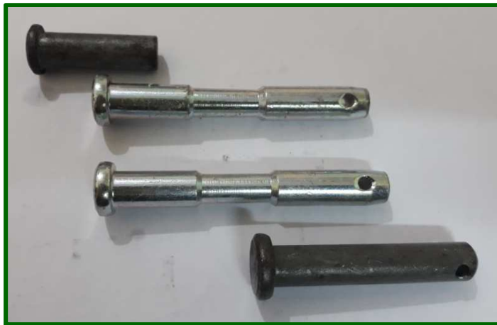
Plain & Special Pin