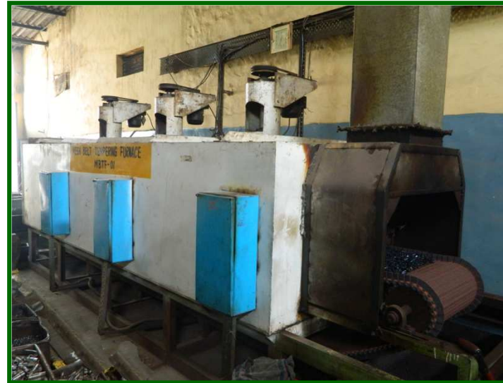
MESH BELT TEMPERING FURNACE