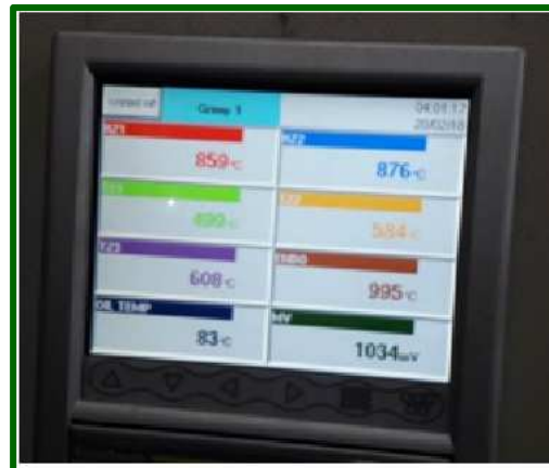
HT Control Panel with On-line Data Recorder