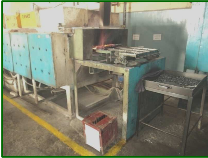
SHAKER HEARTH HARDENING FURNACE