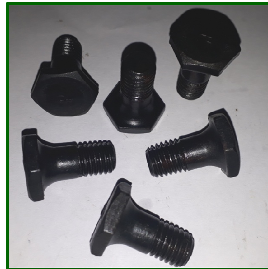
Thin Head Radius Bolt