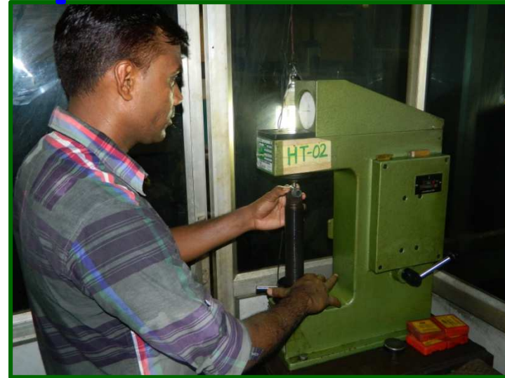
Rockwell Hardness Tester