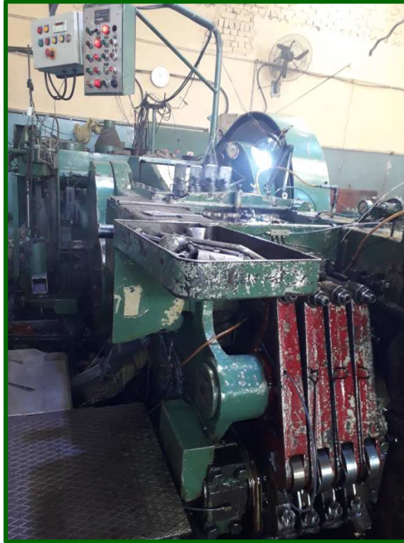
5 Station, 4 die, Bolt Former Make: Nedschroef, Belgium