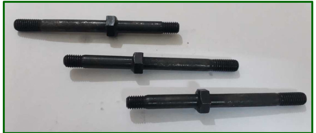
Stud with Hex