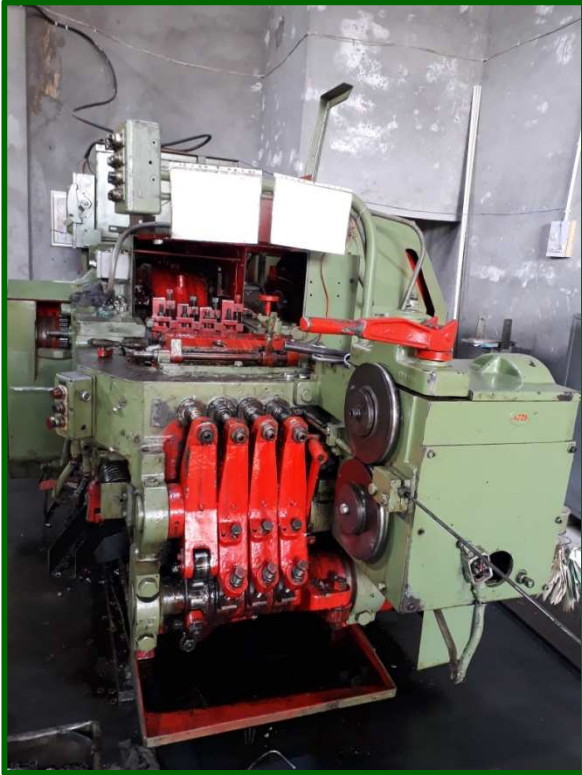
5 Station, 4 die, Bolt Former Make: Naitonal, USA